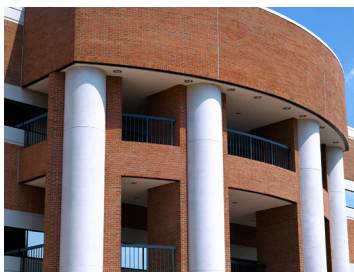
UNC CHARLOTTE CAMPUS FRIDAY BUILDING